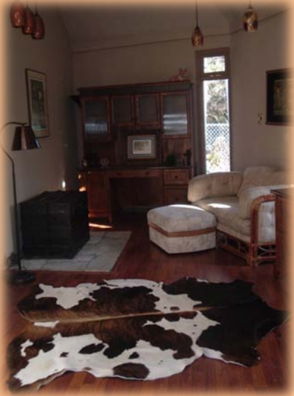
The Guest Room next to the Clinic