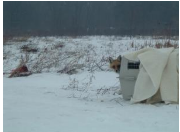
As soon as weather is mild and our 6 feet (!!!) of snow is melted, the fox is released back into his old territory to meet back up with his mate.