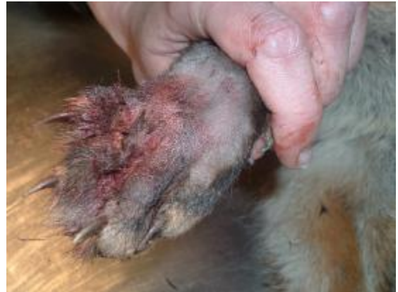
Three toes are severed and hanging only by skin. The foot is shaved and cleaned for surgery