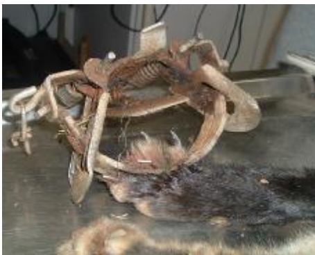
The rusted trap was frozen shut and had to be removed with tools at the SPCA